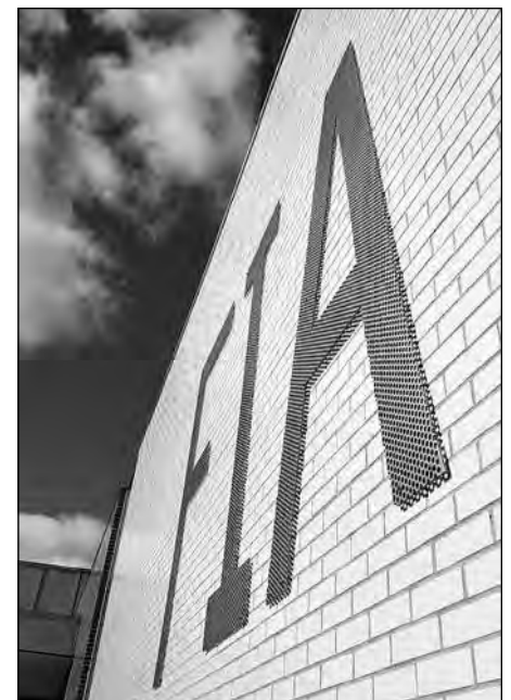
Flint Institute of Arts south entrance

“To have this resource where you can go to an art museum and a science history museum in one visit and including the planetarium,