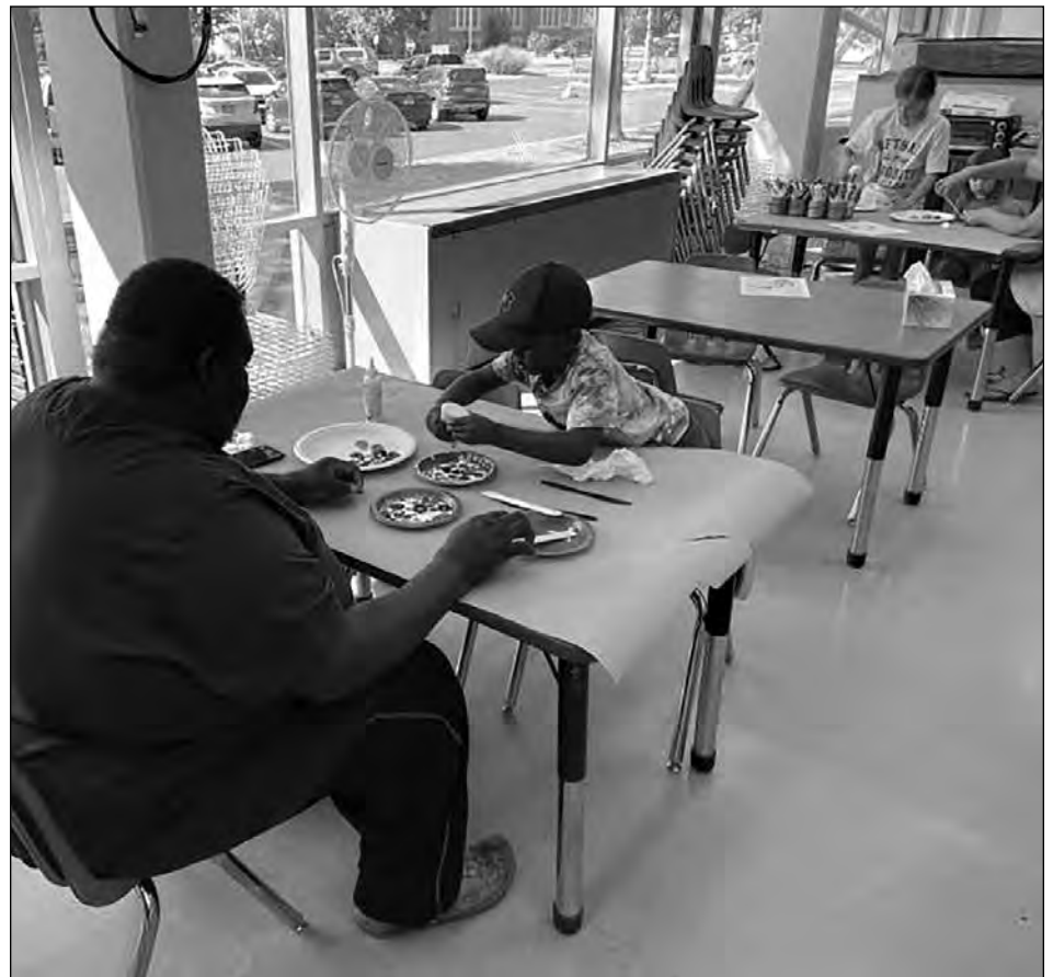
Art workshops and courses are offered year-round to the community

over 8,500 objects with some spanning back 5,000 years. Most of the