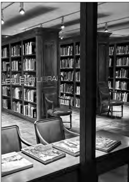
LeFleur Library at the FIA