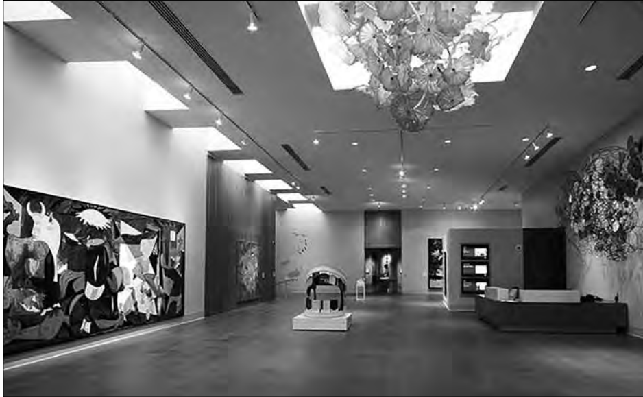
Kearsley Street entrance to FIA