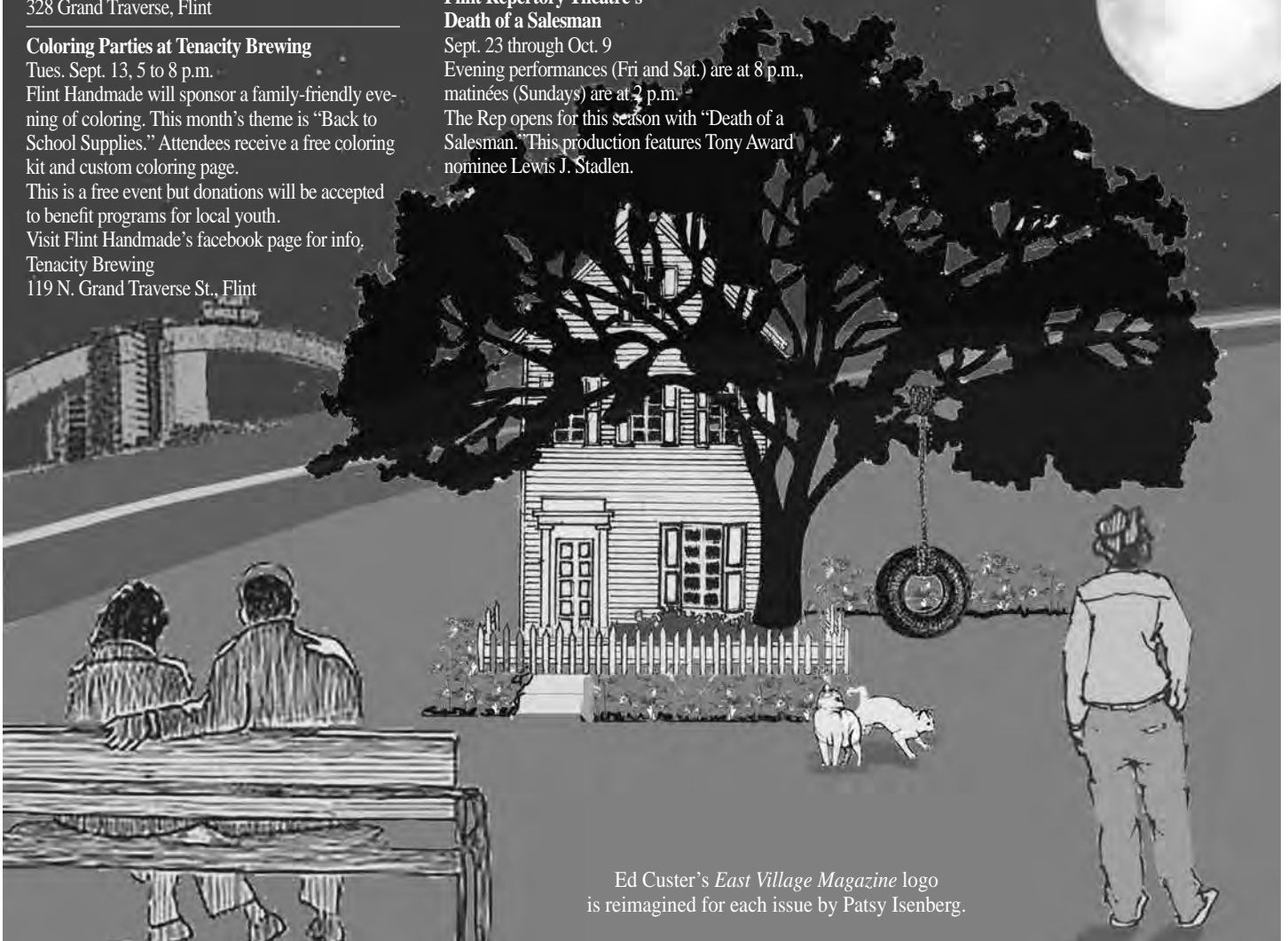
Ed Custer's East Village Magazine logo is reimagined for each issue by Patsy Isenberg.