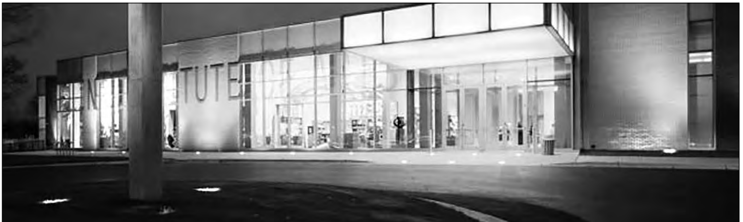
Flint Institute of Arts at night