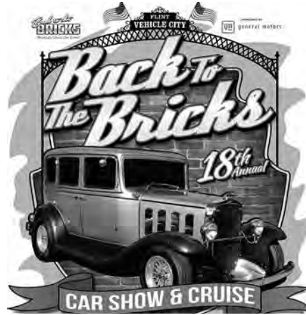
Back to the Bricks graphic

Back to the Bricks is a week-long series of events that draws more than 500,000 visitors to the Flint/Genesee