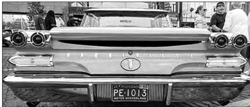
Rear view of James and Pam Bogart’s 1960 Pontiac Bonneville

County area. A car cruise that travels up and down Saginaw Street two evenings during the week, from downtown Flint to Grand Blanc, draws crowds to the curbs all along the route to watch the parade of