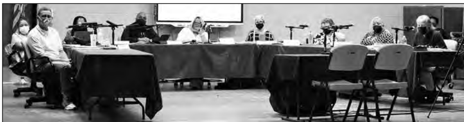
FBOE meeting from May 2022