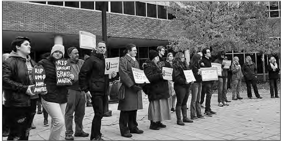
Participants in the One University rally in McKinnon Plaza at UM-Flint