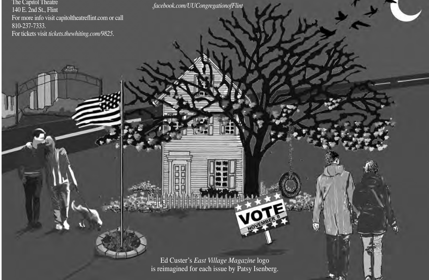
Ed Custer's East Village Magazine logo is reimaged for each issue by Patsy Isenberg.