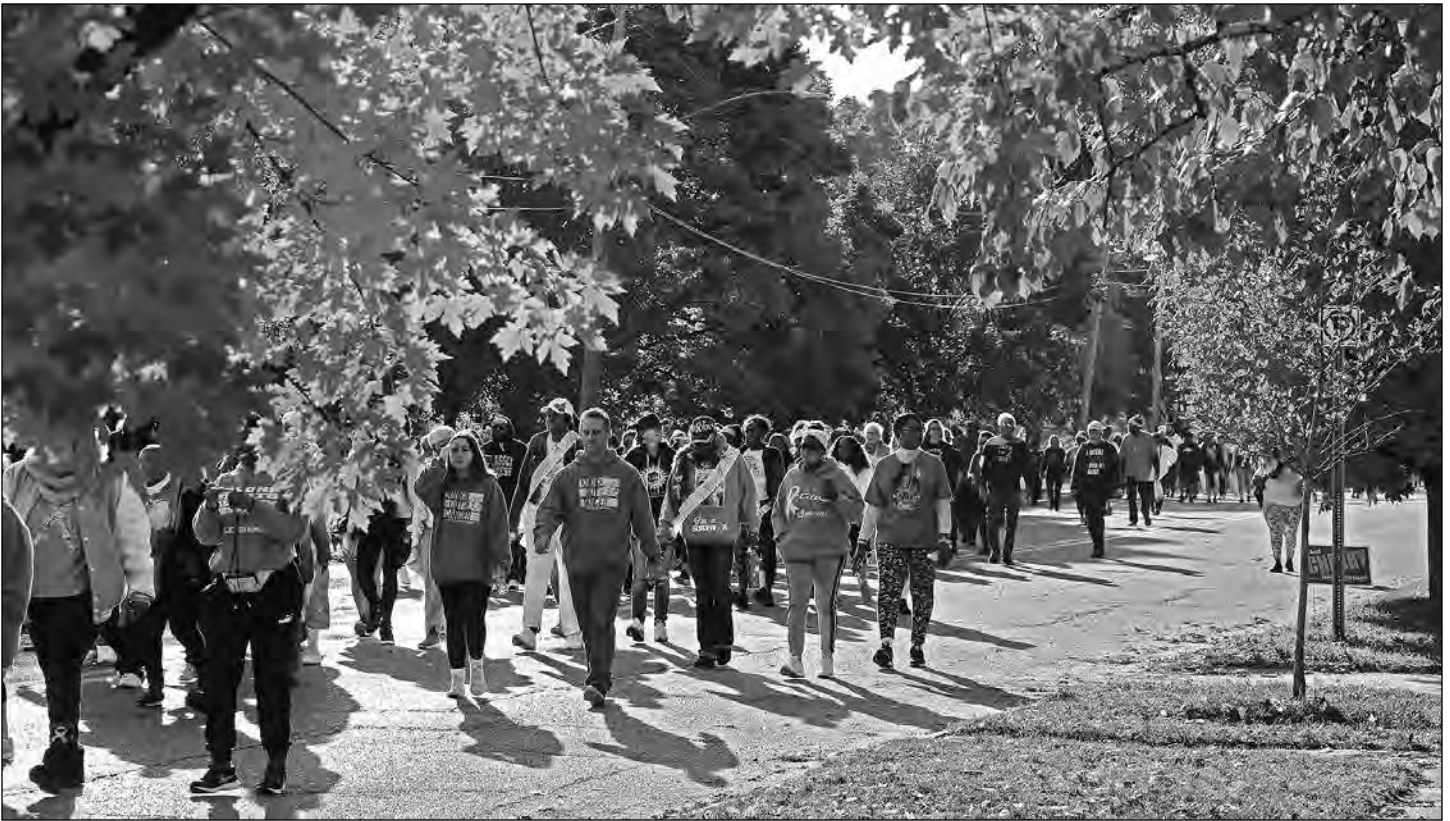
Photo of the Month: Making strides against breast cancer