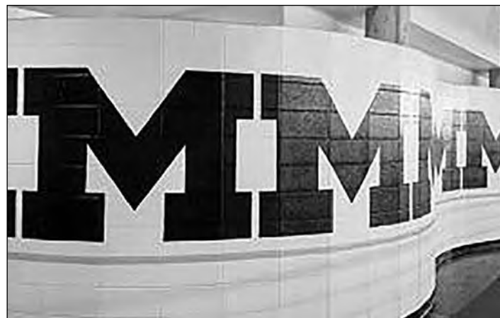
UM-Flint Recreation Center