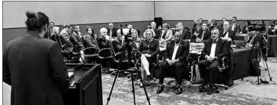
University of Michigan Board of Regents meeting at UM - Flint