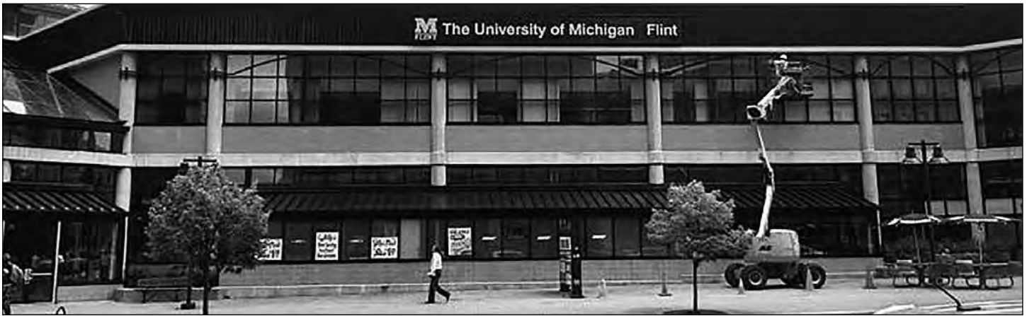
The UM-Flint University Pavilion on Saginaw St. downtown Flint