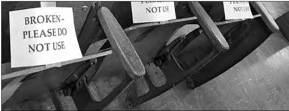
Some of numerous broken chairs in the city council chambers at City Hall

But that dull meeting over the budget (and similar topics) is the real business of government, and the dysfunction has led to a dramatic distrust in all institutions. That distrust can have profound implications for the future of democracy.