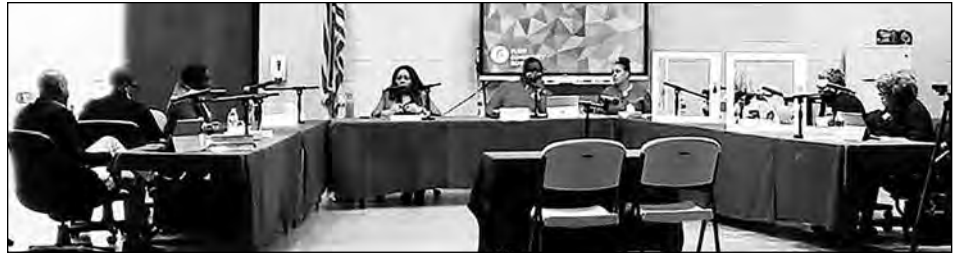
Flint Board of Education with newly elected members seated Photo taken in January 2023.

• Luna, new FBOE treasurer, acknowledging the sweep of all FBOE incumbents from office