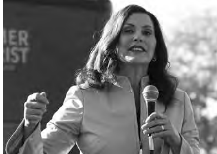
Gov. Gretchen Whitmer October 2022 campaign event in Flint

versity, and an independent group of faculty, staff, students, and alumni also have been sponsoring town halls. We’ll see how well