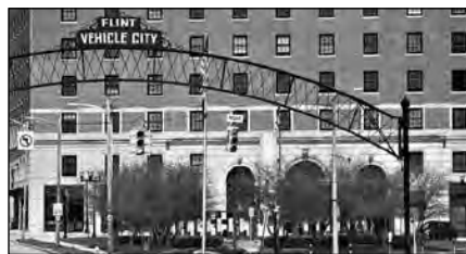
A vehicle city arch in downtown Flint. The historic Durant Hotel in the background

difficult to for the U.S. House to produce any meaningful policies? At the moment it seems the likely prospect. To win the speakership, McCarthy gave up a lot of power to a small cluster of Republicans who may limit his options for the future. After 15 votes on what normally is a routine process, will they be able to agree on any major policies? The last time the House took this long to pick a speaker was just before the Civil War.