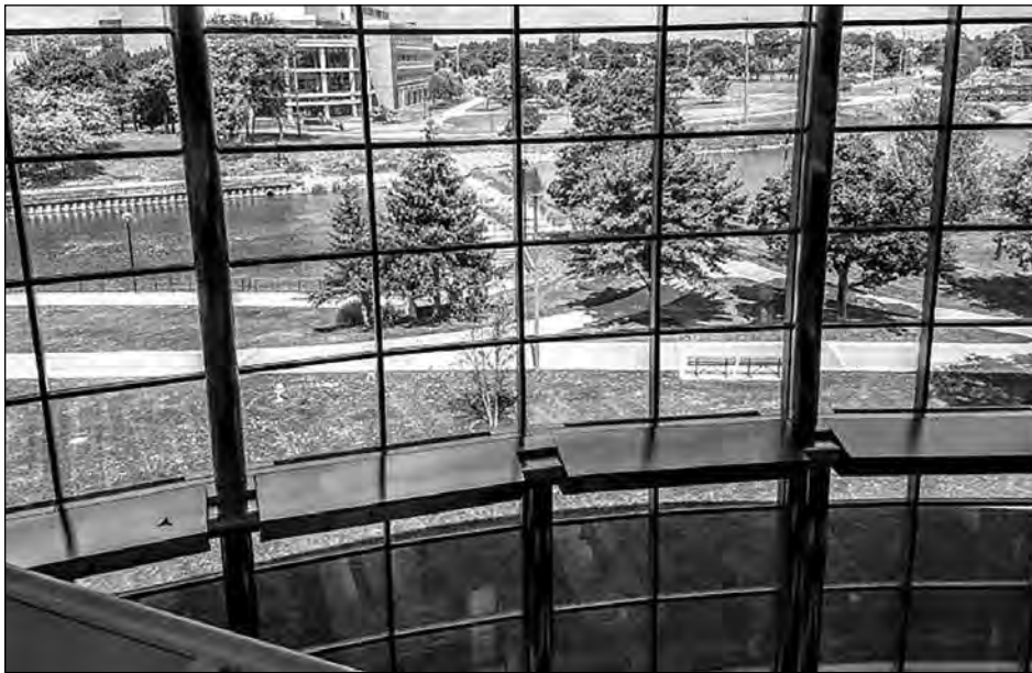
Photo taken from the third floor of the UM - Flint Library looking north across the Flint River and the William S. White building on the north end of campus