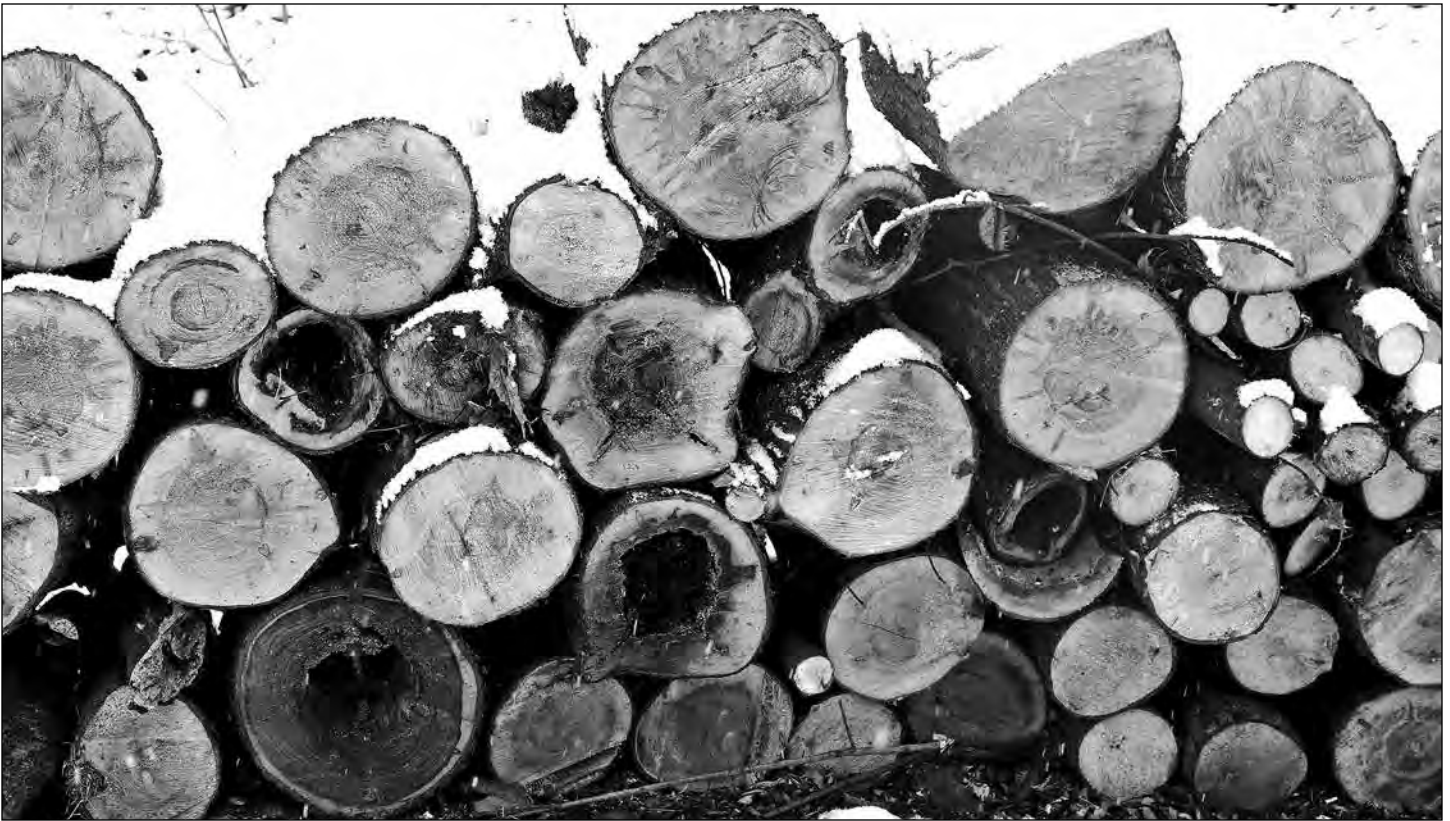
Photo of the Month: For the Warming Winter Fire