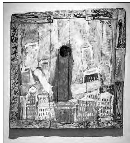
Overtown Street Concert by Purvis Young is displayed in the Contemporary wing of FIA

The FIA has been collecting artwork by artists of color since 1969 and today the collection includes more than 320 artworks. The gallery highlights some of the most important artists from the mid-twentieth century to present through paintings, sculpture and mixed