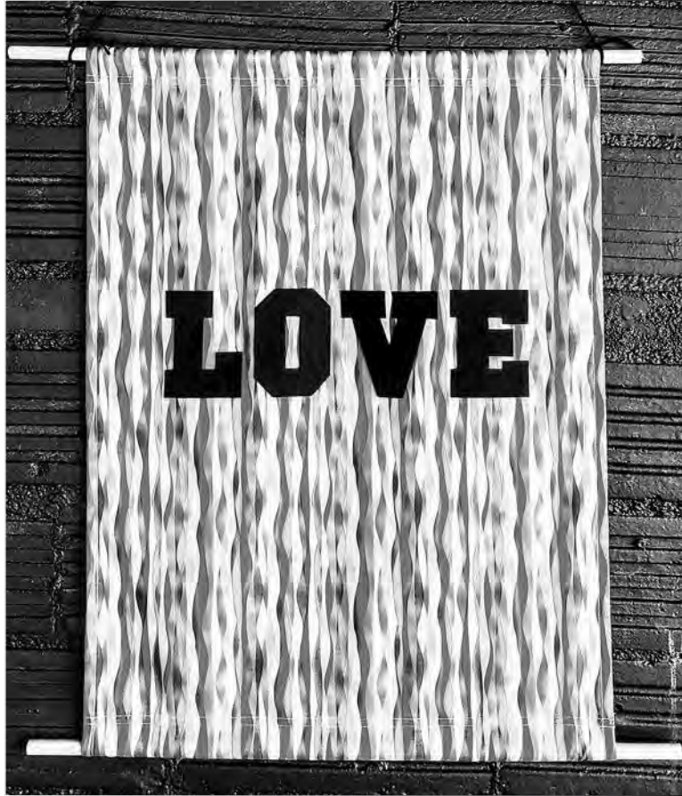
This banner hangs in Peoples Church of Flint

What are all of us are looking for?...love. That word is one of those words that is overused and misunderstood like nice, great, cool...what do those words actually mean? Love-shmove, what does love mean?