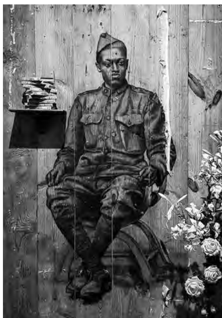
"Epoch" by Whitfield Lovell, charcoal on wood and found objects

Several of these artworks were created through traditional techniques such as drawing, woodcut, lithog-