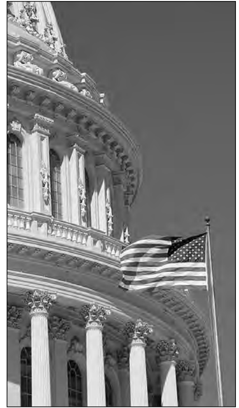
U.S. Capitol in Washington D.C.

On the state level, Gov. Gretchen Whitmer has a Democratic majority in the legislature for the first time in 40 years. But it is a narrow majority and she will often need to work with Republicans to get things done. With a potential budget surplus this year, there seems to be some real conversation between the