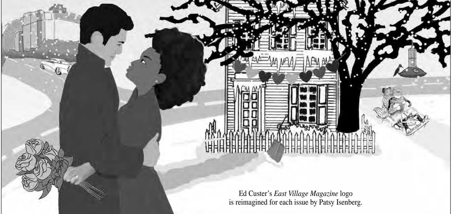
Ed Custer's East Village Magazine logo is reimaged for each issue by Patsy Isenberg.

For tickets visit tickets.thewhiting.com .