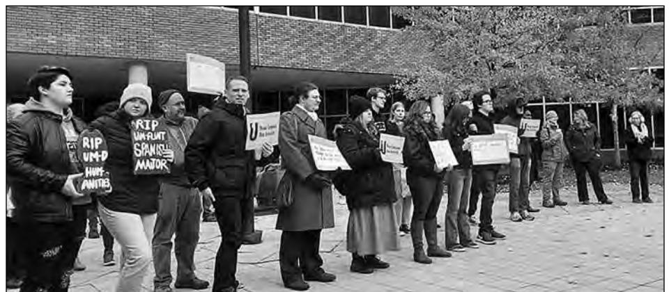
Strategic Transformation protesters gather on the UM - Flint campus