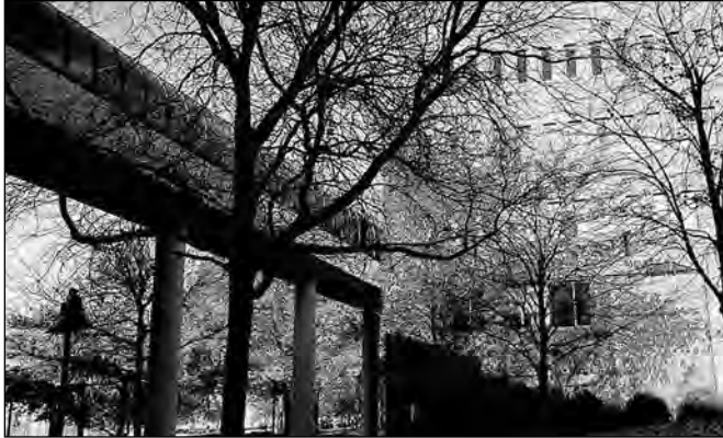
French Hall on the UM-Flint campus in downtown Flint