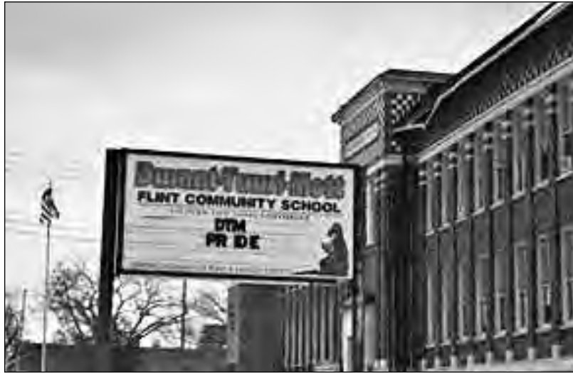
Durant-Tuuri Mott school on University Ave near Kettering University