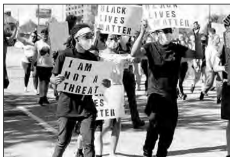
Black Lives Matter Flint protesters marching downtown Flint in June 2020

The fact is that most of the book bans are not so much about banning books, or keeping books off the library shelves, as they are about rallying a political crowd around an attempt to