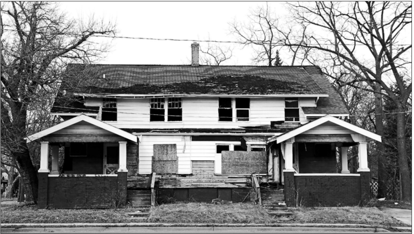
Photo of the Month: Flint's blight looks worse in spring: 801-803 E. Court St.