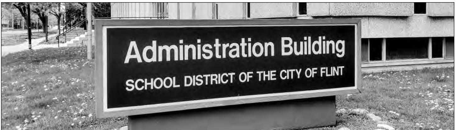
FCS administration building

• Clack: “Who put it (the payout) ...” (Continued on Page 7)