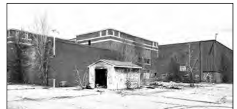
Zimmerman School (southwest view) on Corunna Rd. on Flint's west side