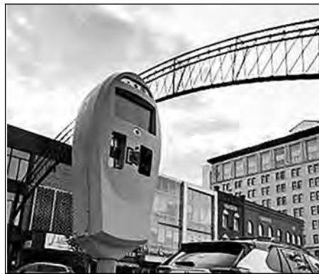
Downtown Flint parking meter

The Flint DDA was established in 2011 under the Public Act of 1975. It is that Authority that is charged, according to their bylaws, with the power "to implement a parking enforcement bureau for parking enforcement in the downtown district". They do so by issuing citations based on the information MPS provides. Tickets are issued and fees are collected by Flint DDA, but it is not clear how much of that money goes to the City.