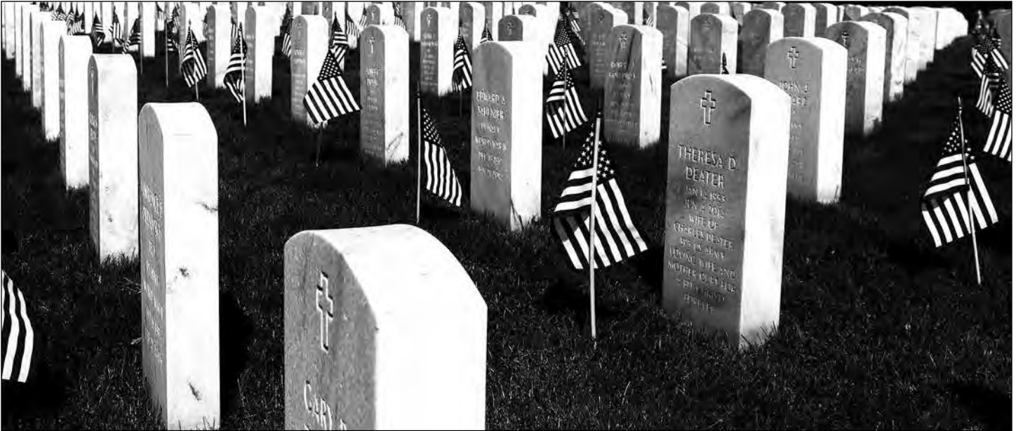
Photo of the Month: Great Lakes National Cemetery, resting place of EVM founder Gary Custer