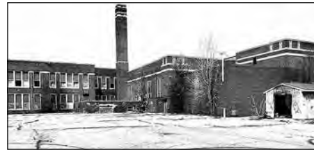
Zimmerman School (southern view) on Corunna Rd. on Flint's west side (Photo by HC Ford)