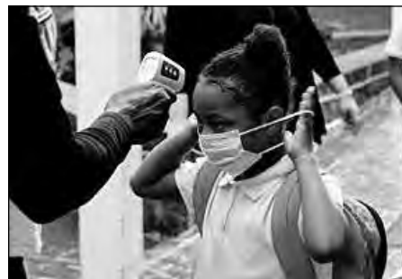
A student masking up as she enters Doyle-Ryder school

In at least three waves of ESSER funding from the Federal Government, Flint Community Schools (FCS) was given access to an amount just shy of $150 million; Flint’s city government, by comparison, was granted an amount just under $100 million. Some of the ESSER dollars have already been spent by FCS.