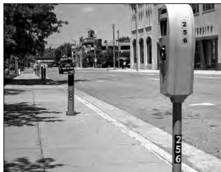
Parking meters on the east side of Saginaw Street