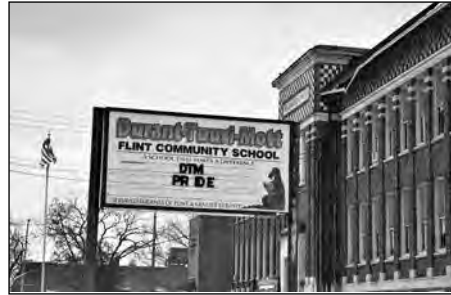
Durant-Tuuri Mott school on University Ave near Kettering University