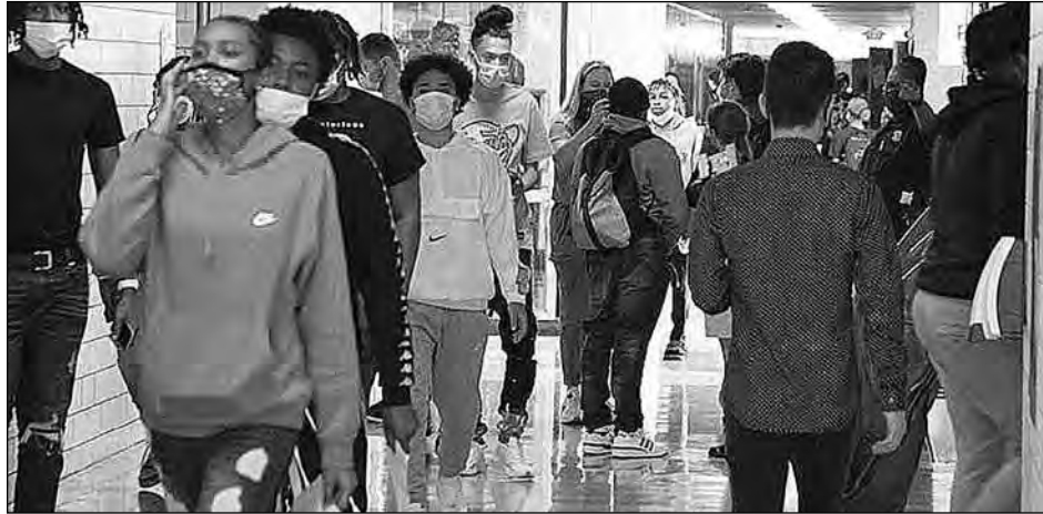
Students at Flint’s Southwestern Academy, Fall of 2022

2021, Michigan Governor Gretchen Whitmer announced plans to develop the Chevy Commons, an area in and around the former industrial site once known as “Chevy in the Hole”, as the location for Genesee County’s first state park.