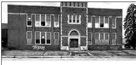
Zimmerman School (northern view) on Corunna Rd. on Flint's west side